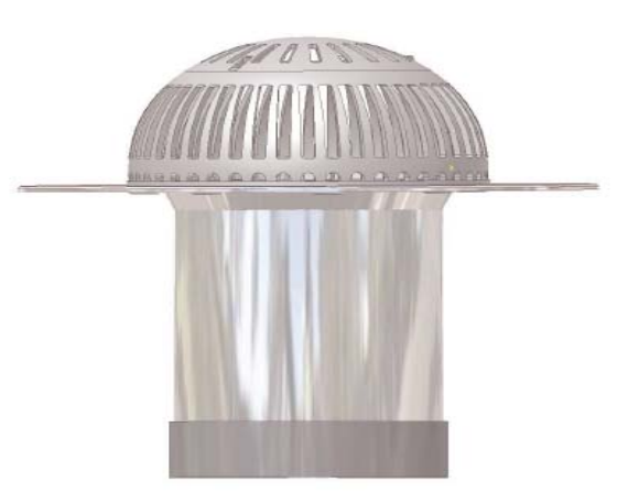
RD-7SS-8 or RD-7SS-10 VANDALPROOF ALUMINUM ROOF DRAIN FOR 8" (203 mm) & 10" (254mm) LEADER SIZE