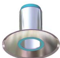
STACK JACK FLASHING SJ-34 7" (178 mm) HIGH

Note: Anchors are designed to resist without fracture and/or pull-out a force of 5400 lbs (24.03 kN), applied in the most adverse direction.