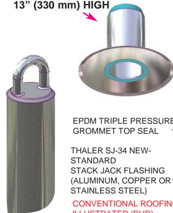
U BOLT EYE (TWA-16U/- 16USS)